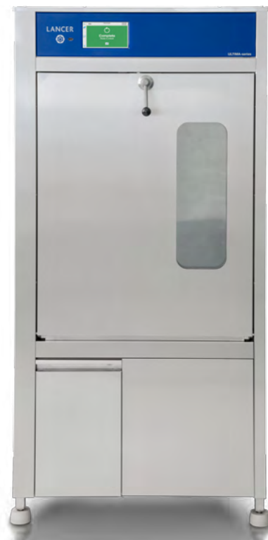
Lancer model 1600 LXP labware washer; shown with optional View-In-Process (VIP) window.

Drawings display front and side of unit with door swing allowance.