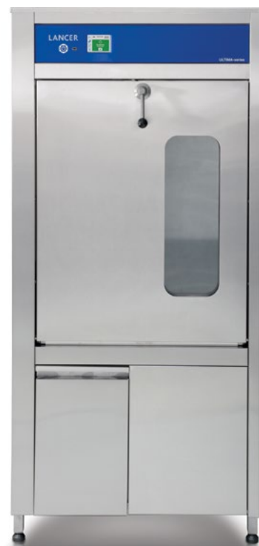
Lancer model 1400 LX labware washer; shown with optional View-In-Process (VIP) window.

Drawings display front and side of unit with door swing allowance.