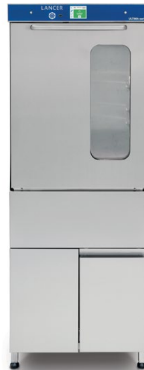
Lancer model 1300 LX labware washer; shown with optional View-In-Process (VIP) window.

Drawings display front and side of unit with door swing allowance.