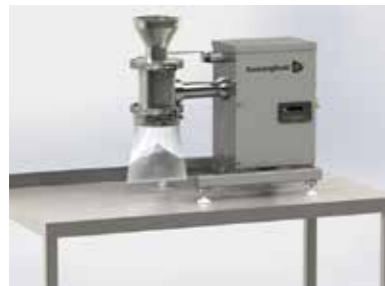
Table Top Laboratory Scale Milling

The Uni-Mill is suitable for isolator integration using our 'through-the-wall' design. This mounts the milling head inside the isolator, whilst keeping motor and controls external.