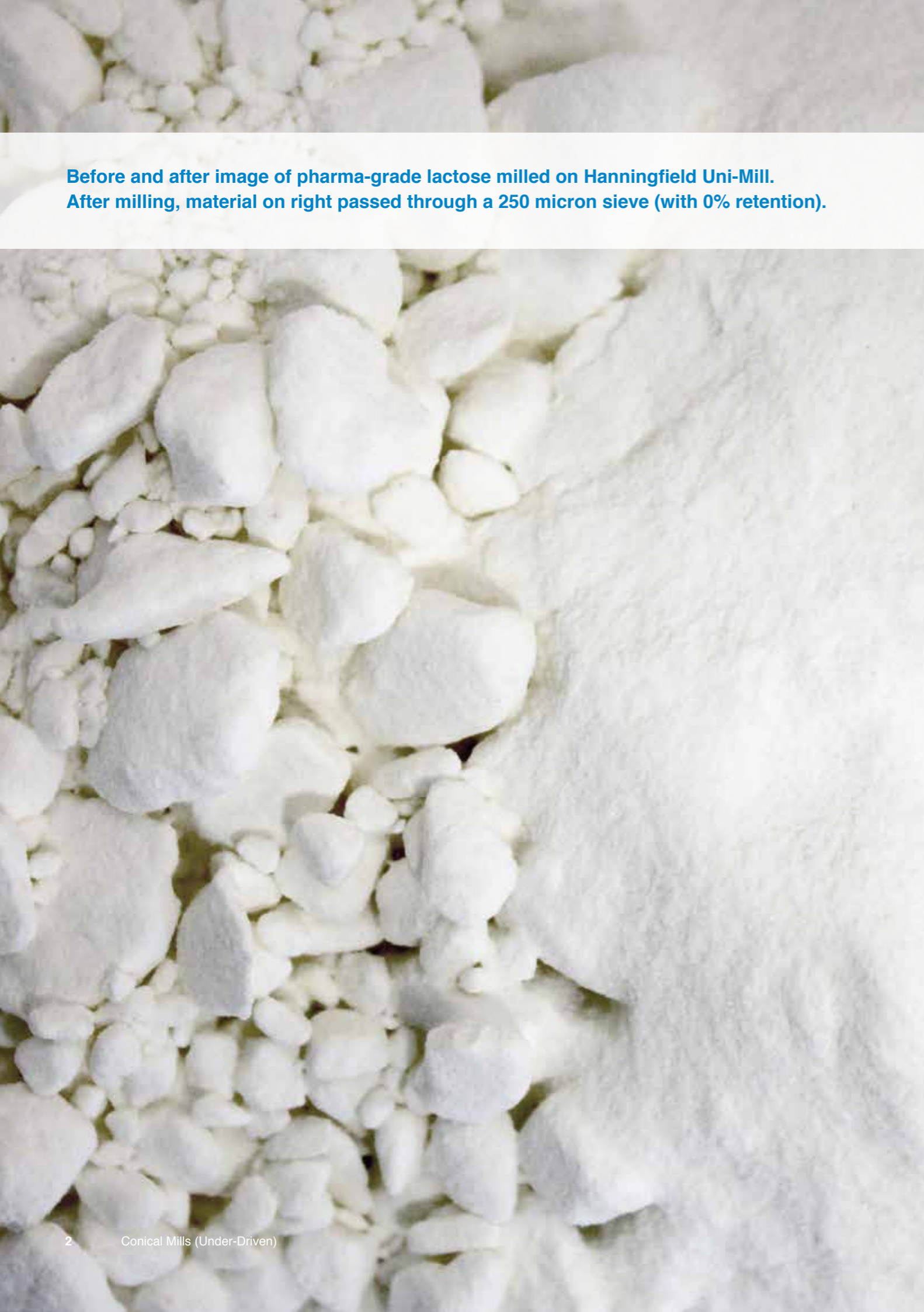
Before and after image of pharma-grade lactose milled on Hanningfield Uni-Mill. After milling, material on right passed through a 250 micron sieve (with 0% retention).